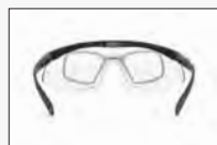
OPTIONAL RX CARRIER