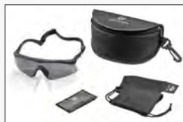
U.S. MILITARY KIT

AVAILABLE IN BLACK, TAN AND FOLIAGE GREEN