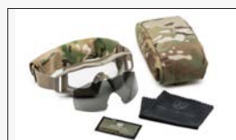
U.S. MILITARY KIT - TAN499 MULTICAM