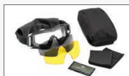
DELUXE KIT - BLACK

*The high-contrast specialty lenses are not approved for military use by the U.S. Army.