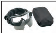
U.S. MILITARY KIT