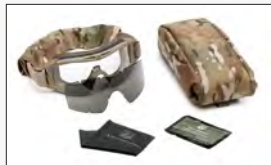
U.S. MILITARY TAN 499 KIT